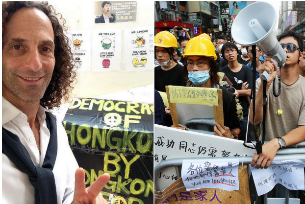
(Kenny G and Hong Kong Umbrella Movement. Source .)

Perhaps we could imagine the tune “Going Home” (famously played at the closing time of shopping malls throughout China), as smooth jazz amplified at high volume: a weaponized soundtrack aimed towards advancing riot police. The bell becomes a cannon. After the Chinese government indirectly accused Gorelick of meddling in official Chinese affairs, his backpedaling included the deletion of Twitter photos, and the following statement: “I am not supporting the demonstrators as I don’t really know anything about the situation...” [16] The cannon becomes a bell again.