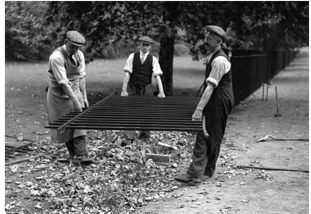
(World War Two, London, England, 7th July, 1940. Workmen removing the metal railings in the Mall around Marlborough House so it can be used as scrap for war purposes.)

“For three years or so the squares lay open, and their sacred turf was trodden by the feet of working-class children, a sight to make divident-drawers gnash their false teeth. If that is theft, all I can say is, so much the better for theft.” — George Orwell, “As I Please,” 1943-1946 [23]